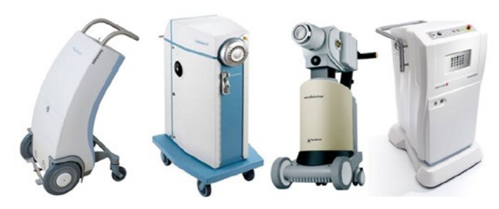
Various HDR Afterloaders

What do Bothwell Regional Health Center in Sedalia, MO and Rice Memorial Hospital in Willmar, MN have in common? It turns out that the former is about a hundred miles east of Kansas City and the latter, about the same distance west of Minneapolis – major metropolitan centers. Both hospitals, located in idyllic rural communities, strive to make the latest/best technologies available to their patients; both had considered HDR brachytherapy offering in the past, and both had decided against it as it was not deemed to be gainfully utilized and was not financially feasible.