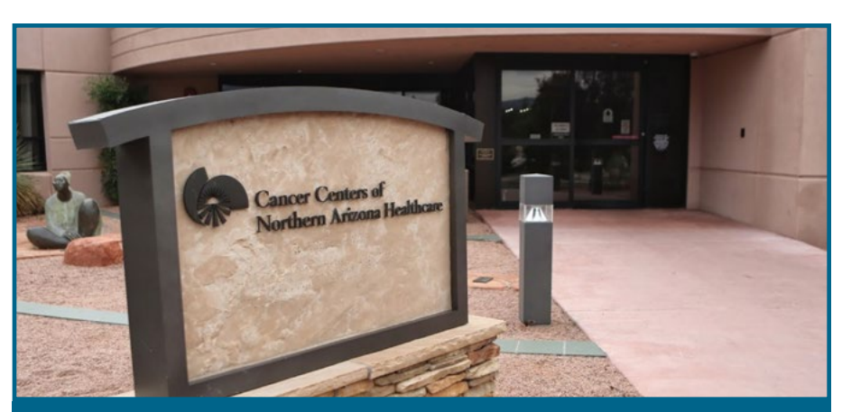
Cancer Centers of Northern Arizona Healthcare in Sedona, AZ