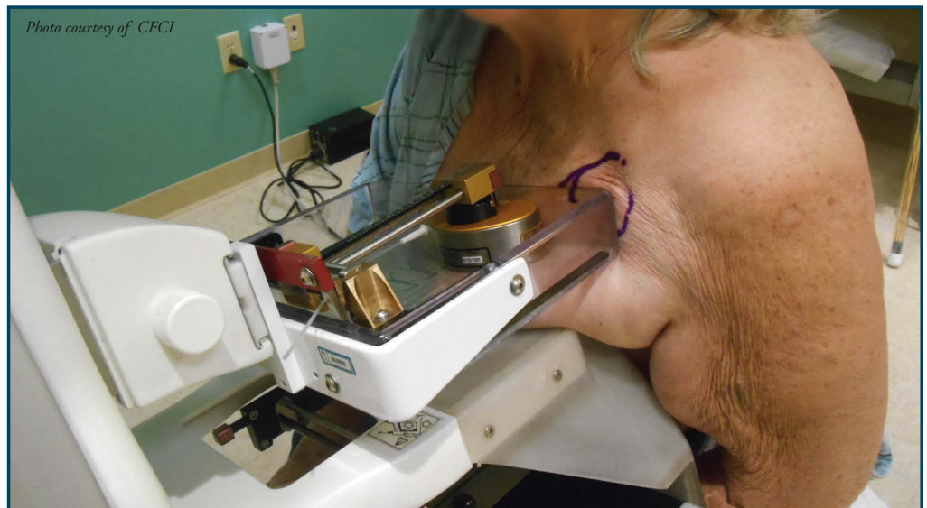
The tattoo on the patient marks the location of the pacemaker while treated along the C-C axis with AccuBoost. The pair of opposing tungsten applicators provide considerable shielding.

A: Radiation therapy patients with pacemakers deserve special attention and it's wise to err on the side of caution when treating these patients. As such, we always communicate our plan for radiation therapy to the patient's cardiologist and work directly with them to ensure that the patient is safely managed.